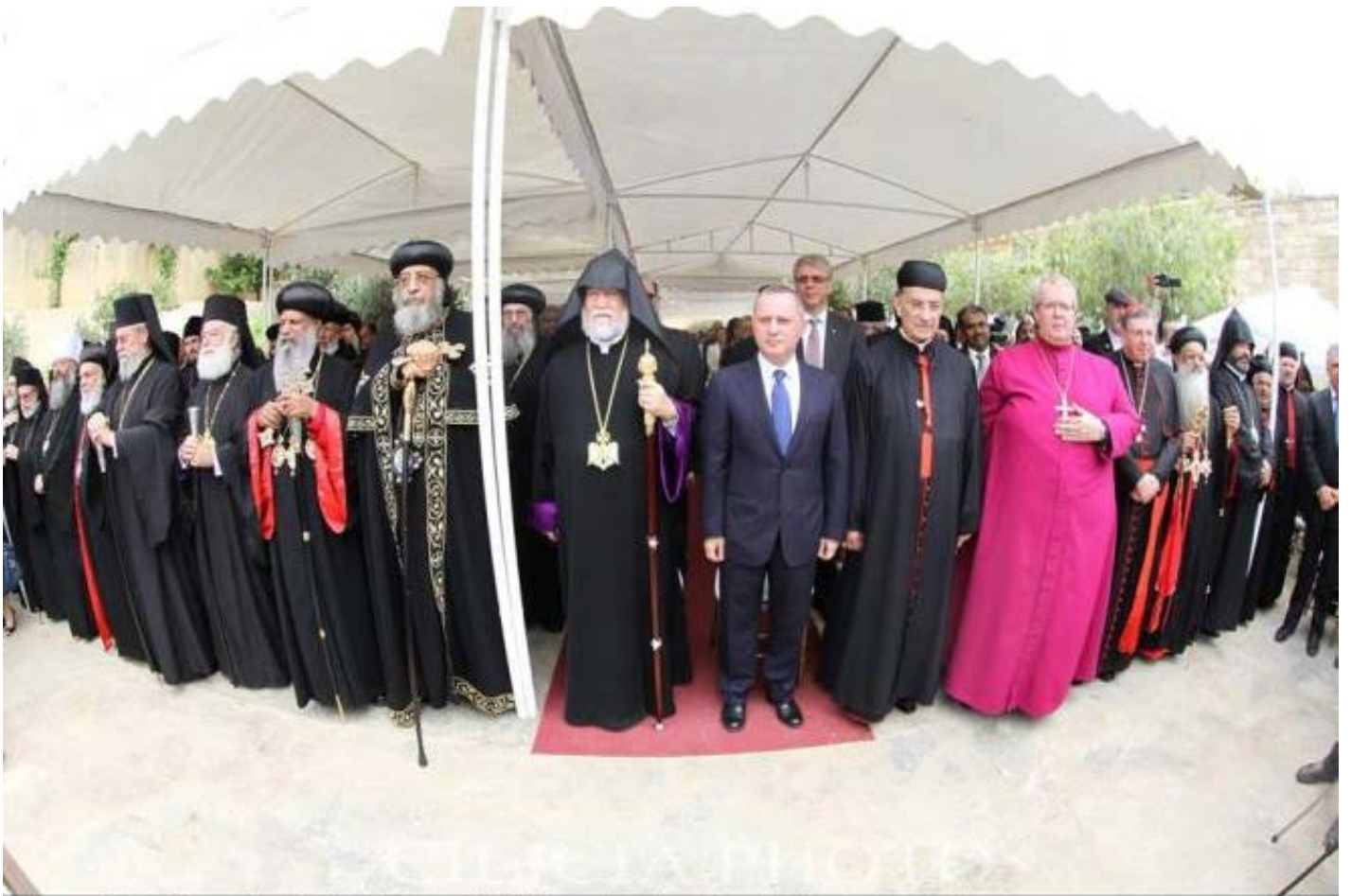
Armenian Church, Holy See of Cilicia - Audiovisual Department / © CILICIA PHOTO/Aram Somoundji