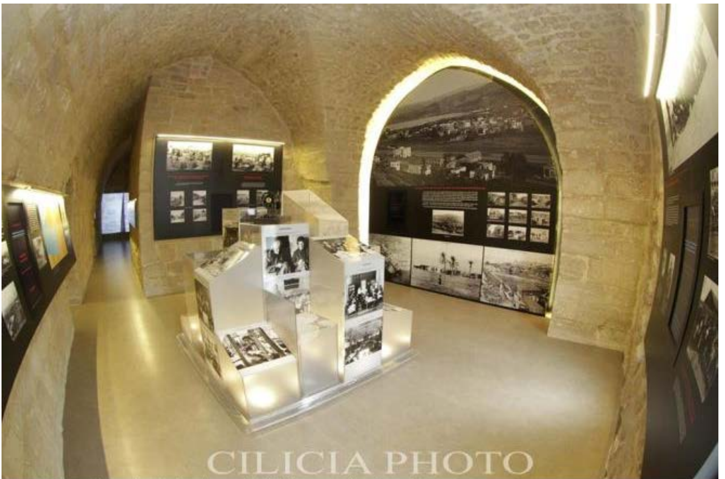
Armenian Church, Holy See of Cilicia - Audiovisual Department / © CILICIA PHOTO/Aram Somoundji