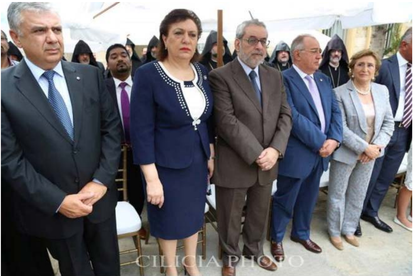
Armenian Church, Holy See of Cilicia - Audiovisual Department