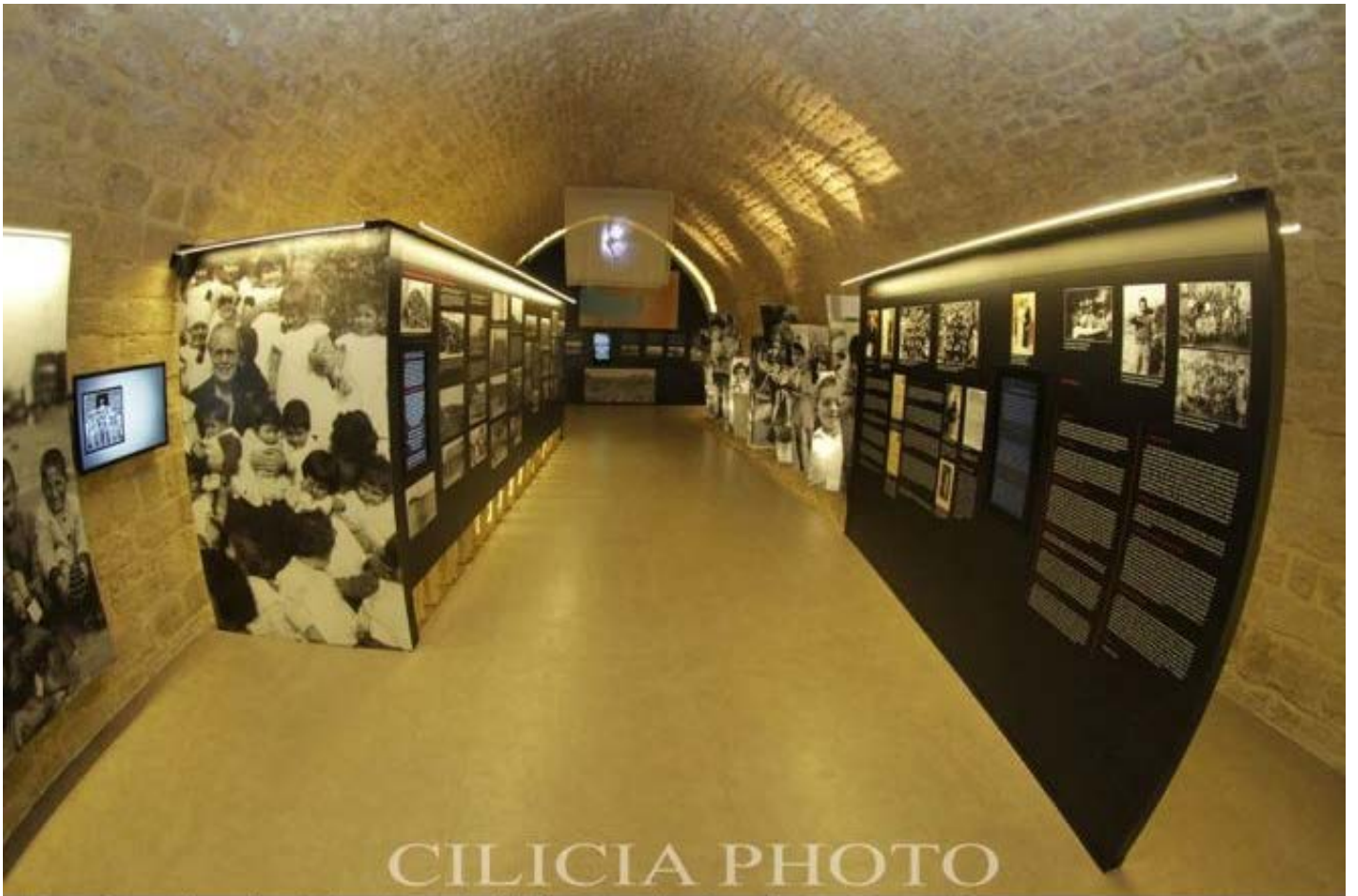
Armenian Church, Holy See of Cilicia - Audiovisual Department / © CILICIA PHOTO/Aram Somoundji