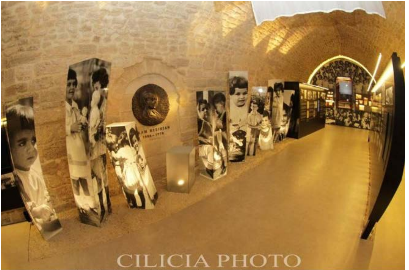
Armenian Church, Holy See of Cilicia - Audiovisual Department / © CILICIA PHOTO/Aram Somoundji