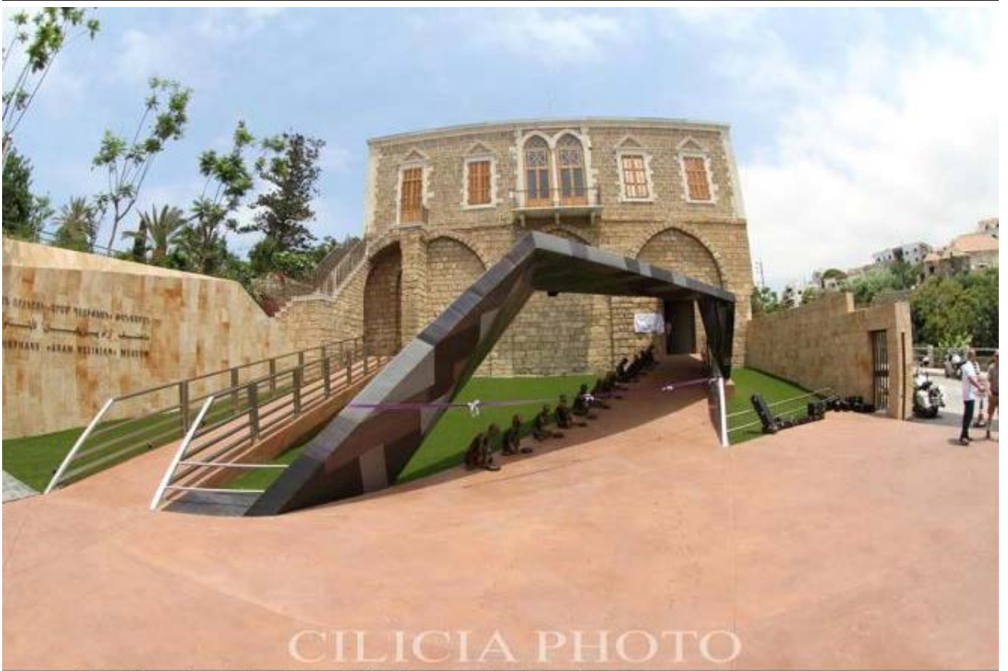
Armenian Church, Holy See of Cilicia - Audiovisual Department / © CILICIA PHOTO/Aram Somoundji